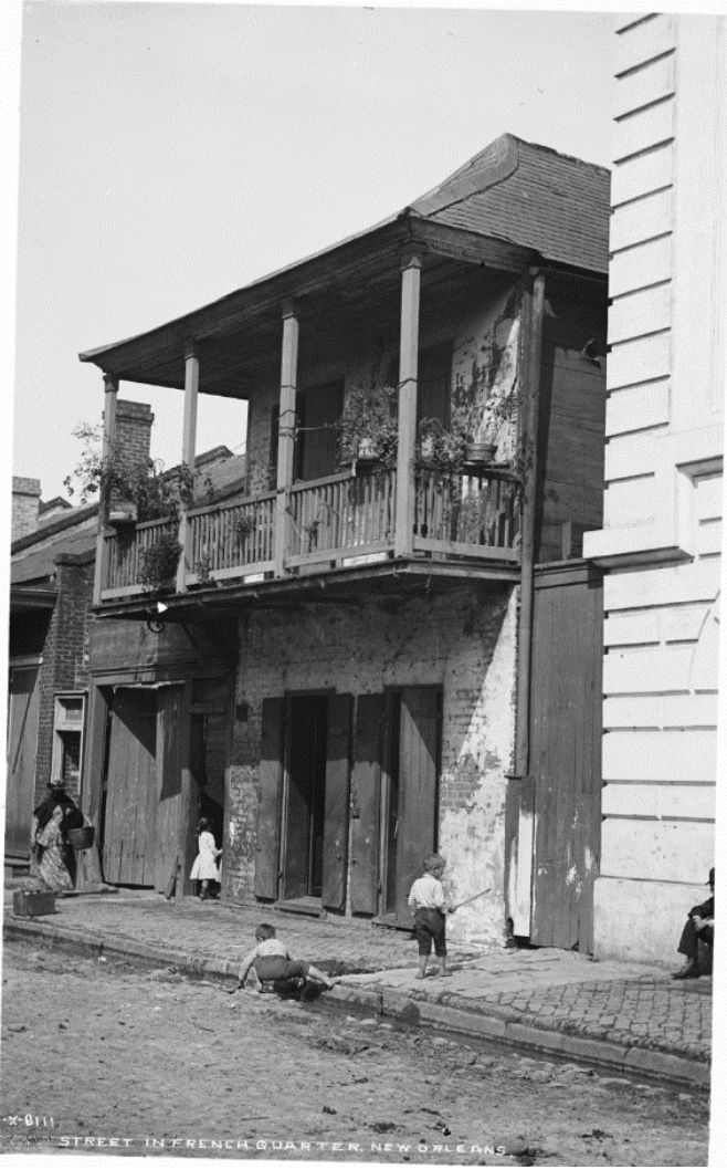
The scene, captured by William Henry Jackson, November 1890—but where?

But the same could be said of adjacent faubourgs, and, realizing that neighborhood names tended to be loose and informal back then, I did not rule out the possibility that this was in the Faubourg Tremé or Faubourg Marigny.